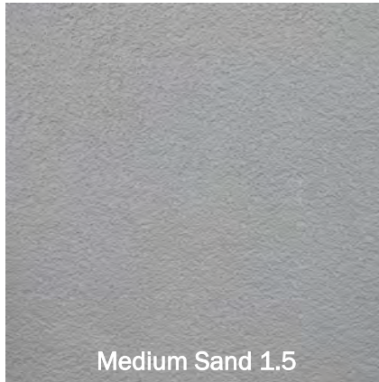
Medium Sand 1.5