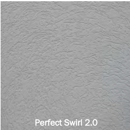
Perfect Swirl 2.0