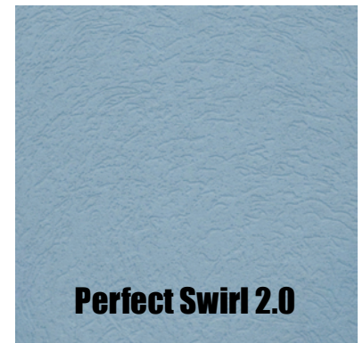
Perfect Swirl 2.0