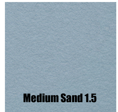
Medium Sand 1.5