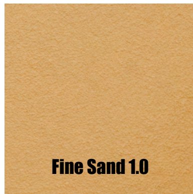
Fine Sand 1.0

*All coverages are approximate and depend upon substrate, details and individual application technique.