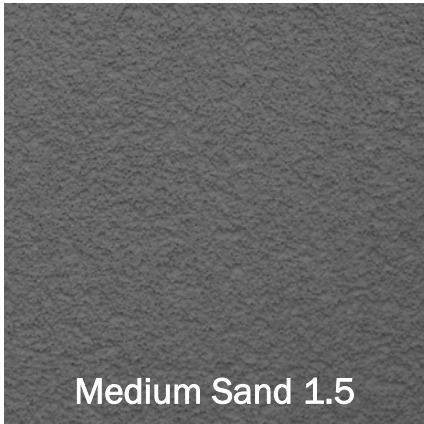
Medium Sand 1.5