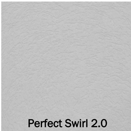
Perfect Swirl 2.0