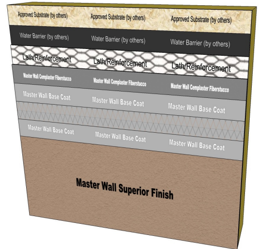
Bulltec Stucco Mesh Embedded in Master Wall® Base Coat