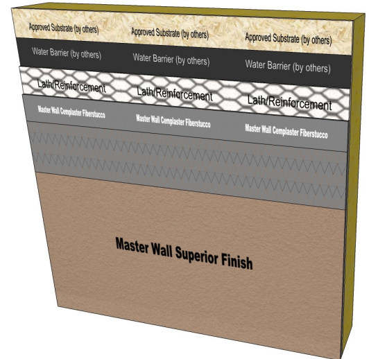
Bulltec Stucco Mesh Embedded in Wet Stucco

Information contained in this product data sheet conforms to the standard detail recommendations and specifications for the installation of Master Wall Inc.® products and is presented in good faith. Master Wall Inc.® assumes no liability, expressed or implied as to the architecture, engineering, or workmanship of any project. This information may be concurrent with, or superseded by other applicable documents, such as specifications and details. Contact Master Wall Inc.® for the most current product information. ©2018 Master Wall Inc.®