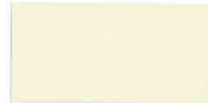
#610 Dutch Cream