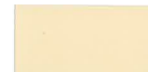
#606 Fuzzy Peach