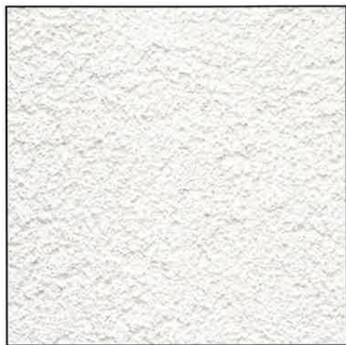
Medium Sand 1.5