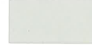
#505 Pearl Gray