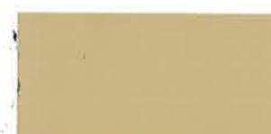
#934 Pebble Sand