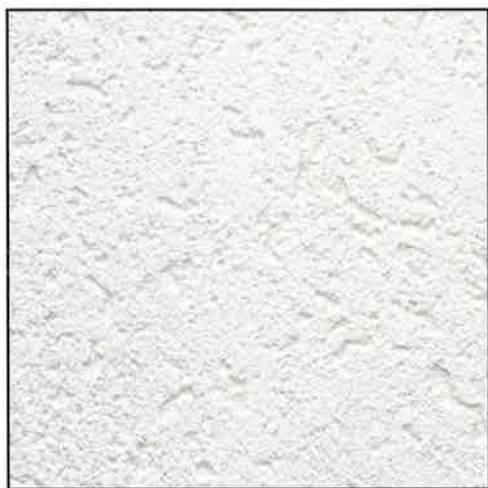
Perfect Swirl 2.0