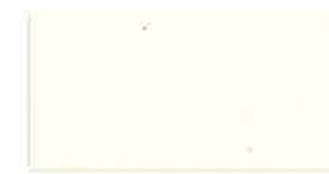
#301 China White