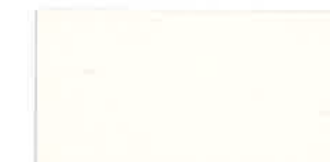
#341 Silky White