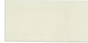
#482 Magnolia White