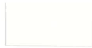
#143 White Waters