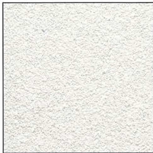
Fine Sand 1.0