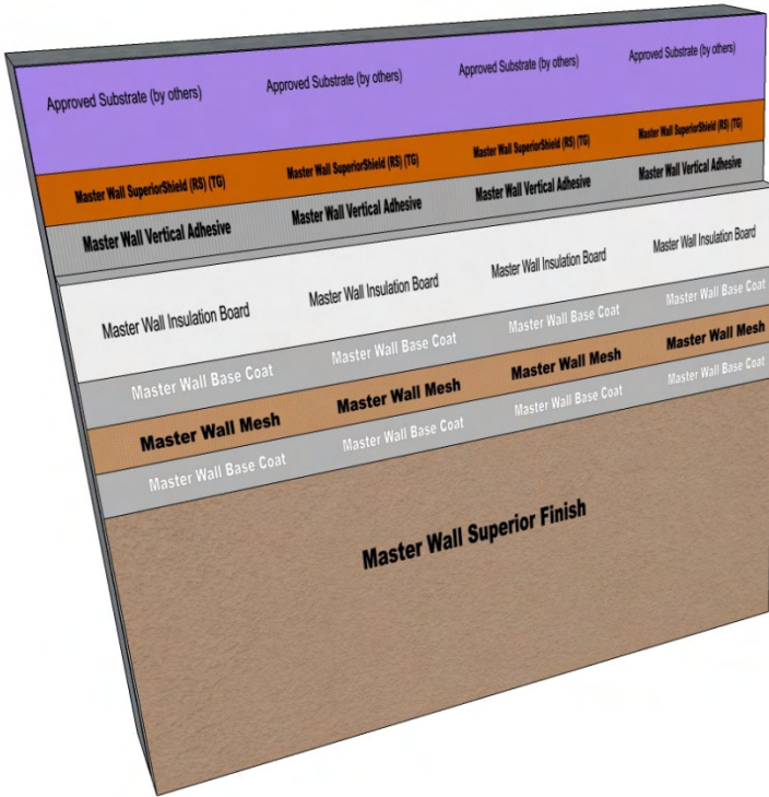
Single Layer Mesh System