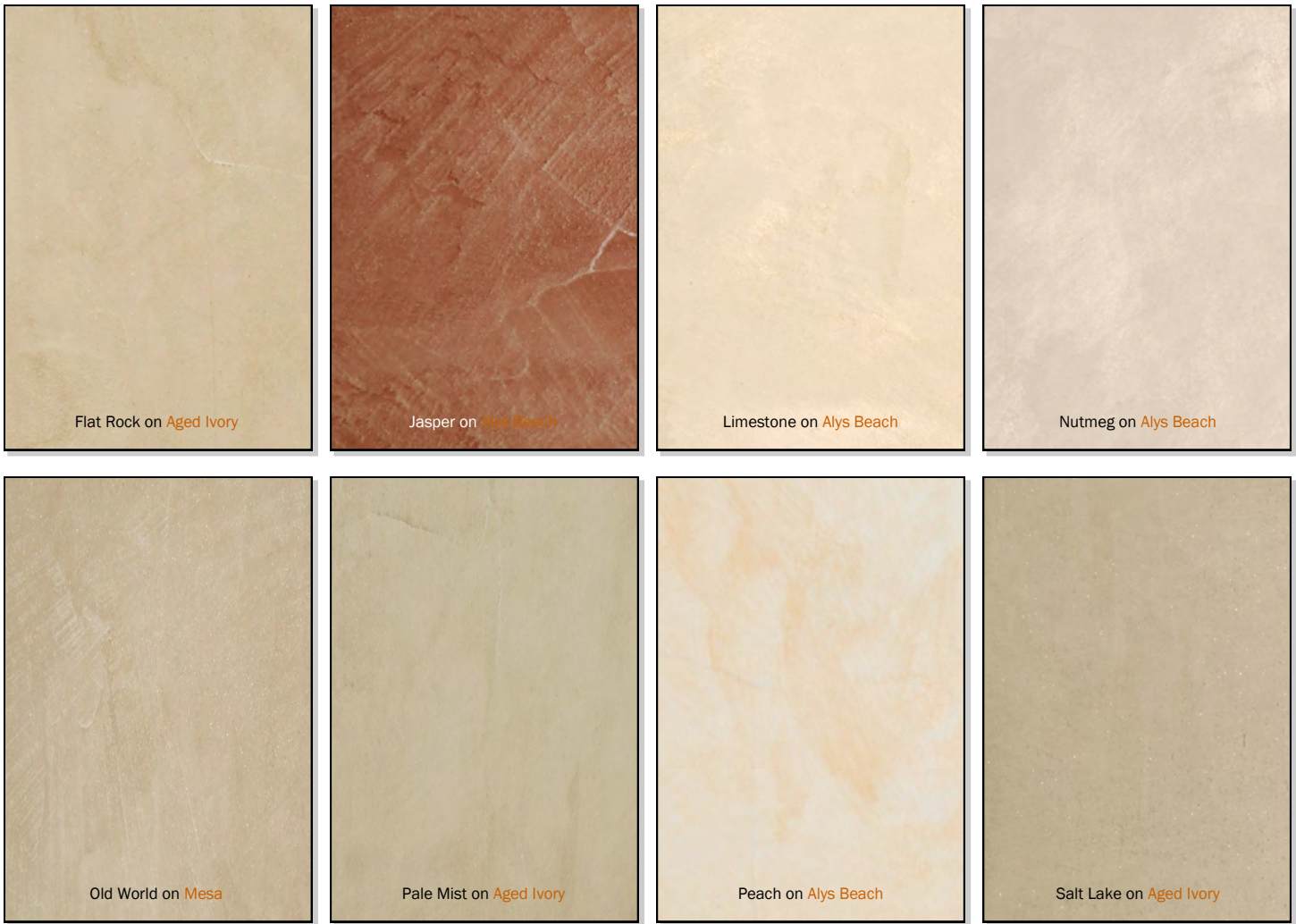
Vintique Color/ Varius Color , sprayed and sponge technique